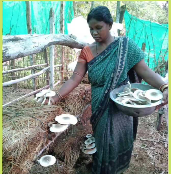
Partner: Paul Hamlyn Foundation

The project strategies are – to develop entrepreneurship, preservation of endangered indigenous seeds, formation of youth collectives to sustain good agricultural practices and create sustainable communities.